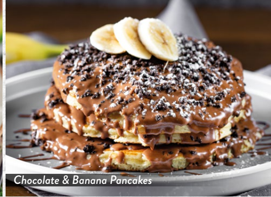
Chocolate & Banana Pancakes