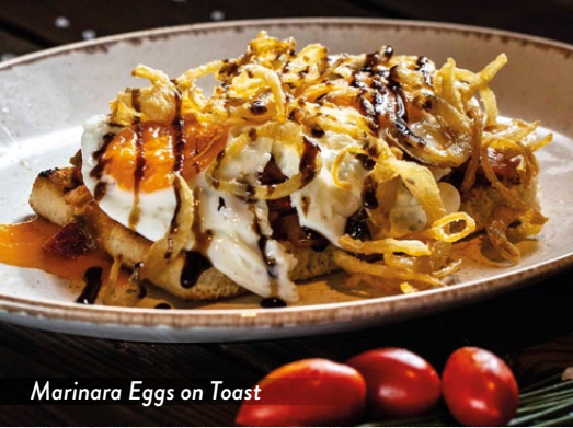
Marinara Eggs on Toast